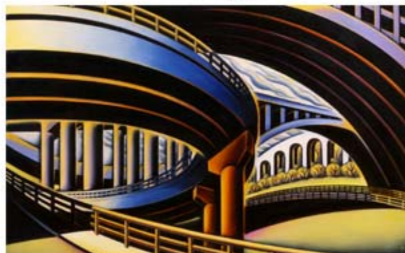
"HARLEM RIVER BRIDGES III"